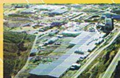
Aerial view of our new state-of-the-art Nueva Aldea plywood plant, north of Concepcion, Chile

Arauco Forest Products B.V. Schiphoweg 114 2316 xd Leiden Phone: 31 (0) 71-7890250 Fax: 31 (0) 71-7890299 The Netherlands E-mail: afp@arauco.nl